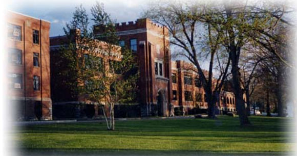
West Virginia School of Osteopathic Medicine

International Fellowship for Prospective Leaders: The Alexander von Humboldt Foundation annually awards ten German Chancellor Fellowships to young professionals in the private, public, not-for-profit, cultural and academic sectors who are US citizens who demonstrate the potential to strengthen ties with Germany through profession or studies. Provides for one year stay in Germany. Applicants design individual projects and decide at which institutions or organizations to pursue them. A bachelor's degree required. Seeking candidates in fields of government, social and policy sciences, law, journalism, communications, management, finance, economics, architecture, public service, the humanities, the arts, and environmental affairs. Life sciences and engineering also considered if topics have a compelling social or humanistic dimension.